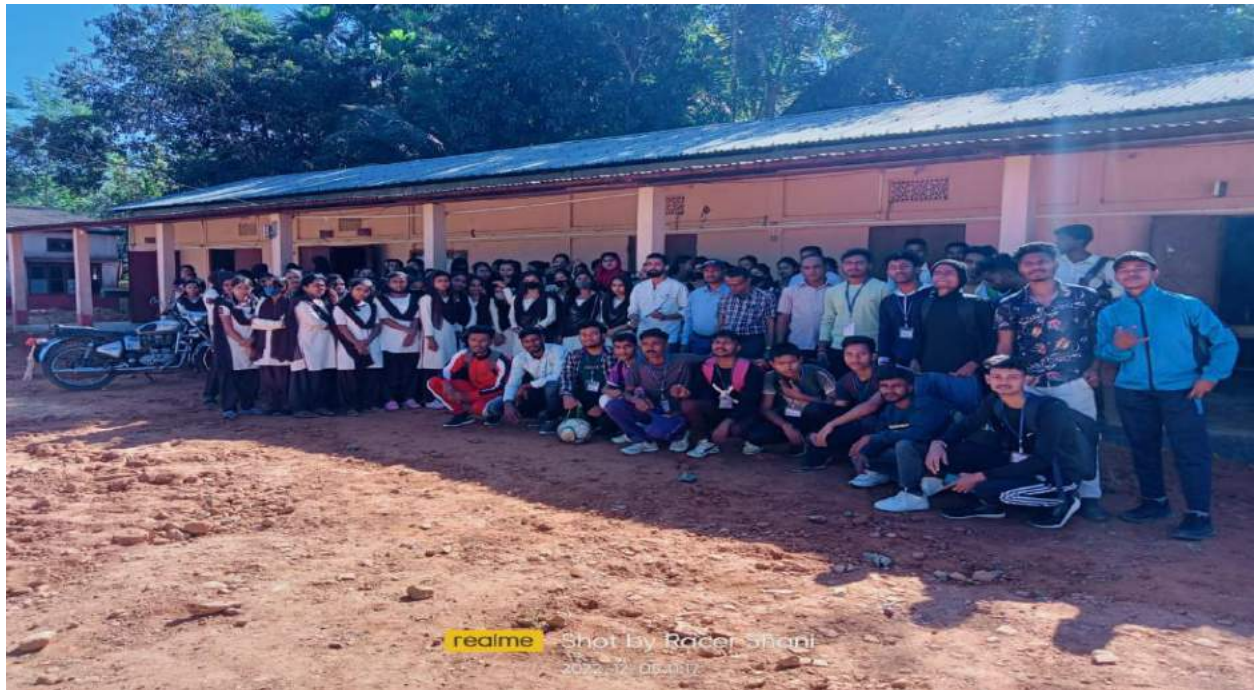
realme 2022/12/05 15:17