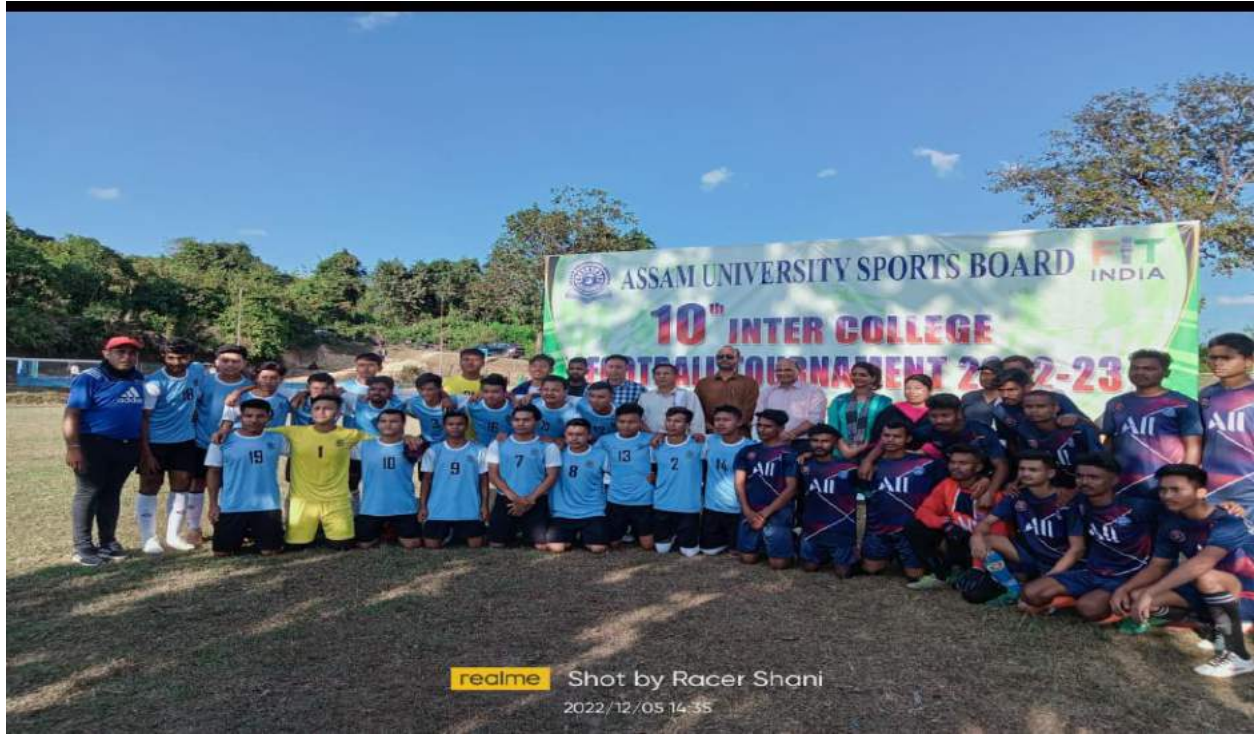
realme Shot by Racer Shani 2022/12/05 14:35